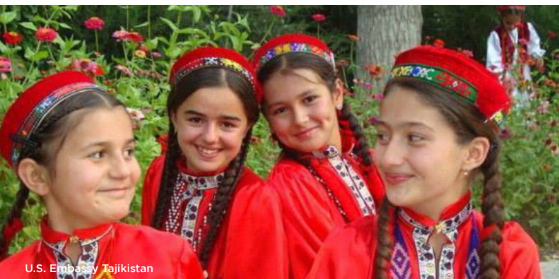
U.S. Embassy Tajikistan